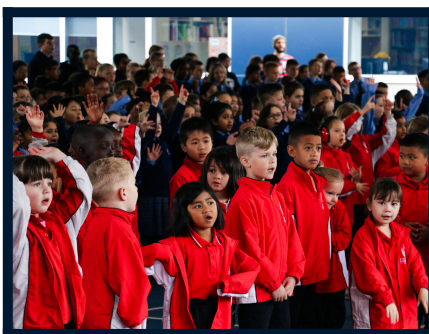
Chapel in the undercover area