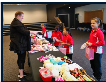
Mother's Day Stall